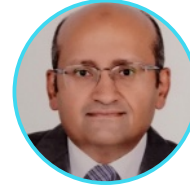
A Mukhtar Egypt