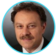
Fuat Saner Saudi Arabia