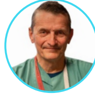
Pal Dag Line Norway