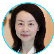
Nancy Kwan Man Hong Kong