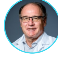
Pierre-Alain Clavien Switzerland